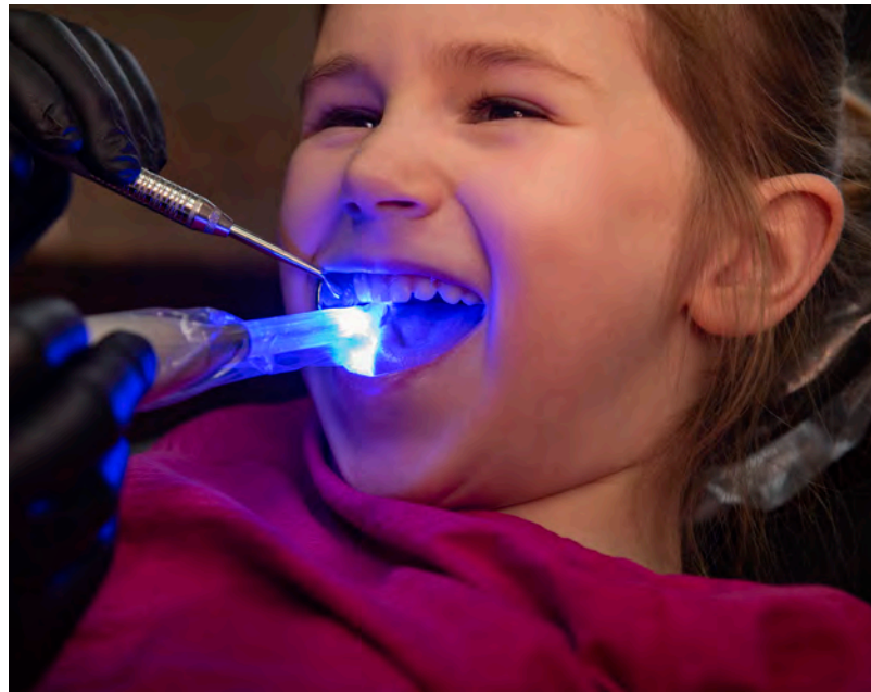
It is common for children to receive dental sealants to protect their teeth.