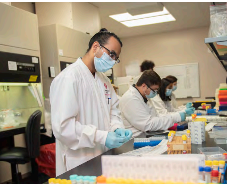
The Integrated Research and Development Laboratory continues to provide COVID-19 tests for more than 6,000 samples that come in from across the U.S. each week.

The Research Institute received a $22.5 million grant from CDC in July 2020 and an additional grant for nearly $20 million in June 2021 to play a leading role in a number of COVID-19 studies. The Research Institute now tests about 6,000 samples a week from across the U.S. These studies demonstrated in real world conditions the effectiveness of mRNA vaccines in both symptomatic and asymptomatic COVID-19 infections.