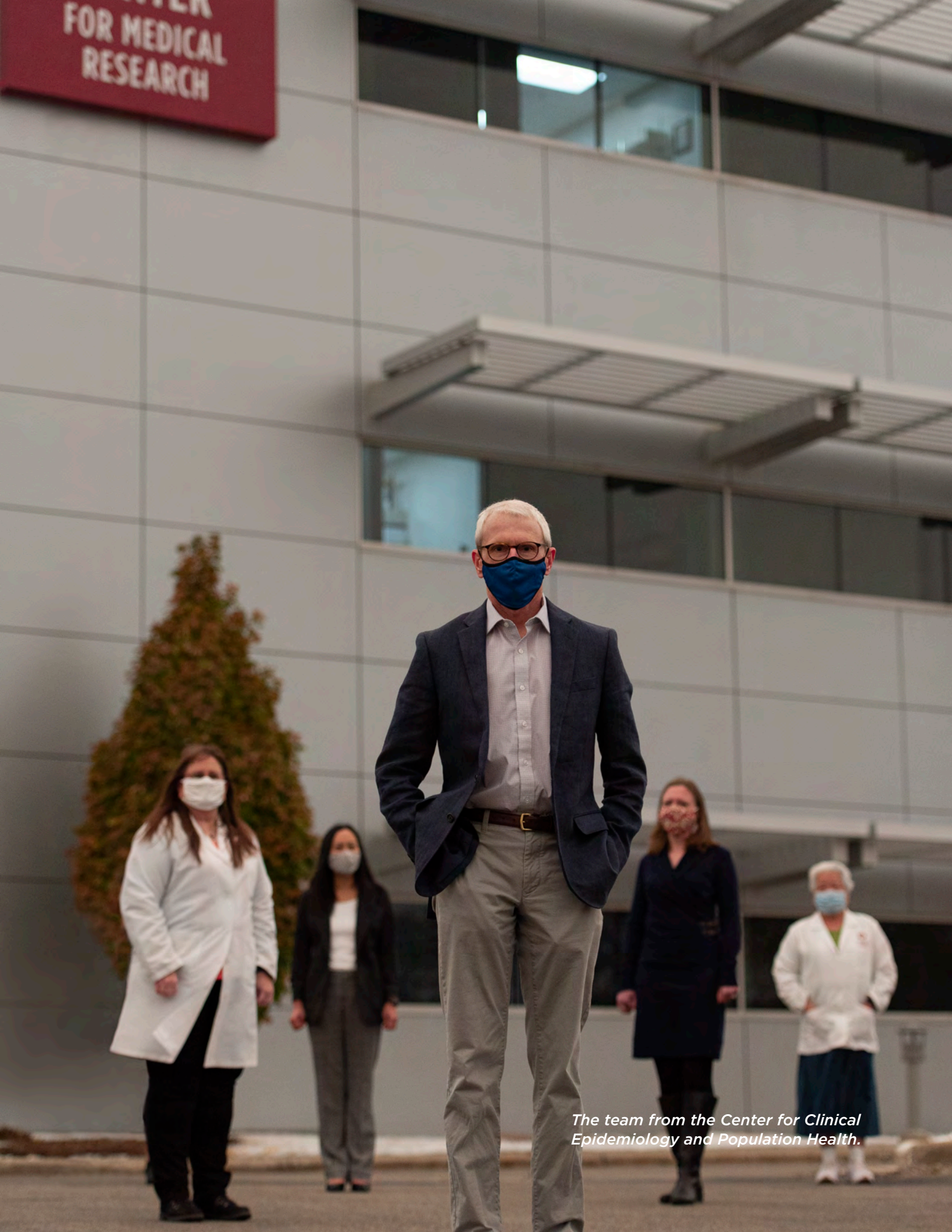
The team from the Center for Clinical Epidemiology and Population Health.