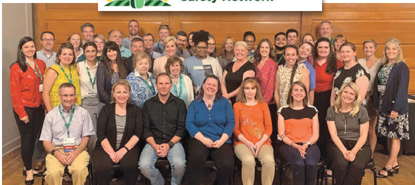
Members who attended the in-person CASN meeting in Fort Collins, CO, during the ISASH conference.