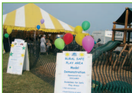
The New York Center for Agricultural Medicine and Health built a Safe Play Area demo at Empire Farm Days.