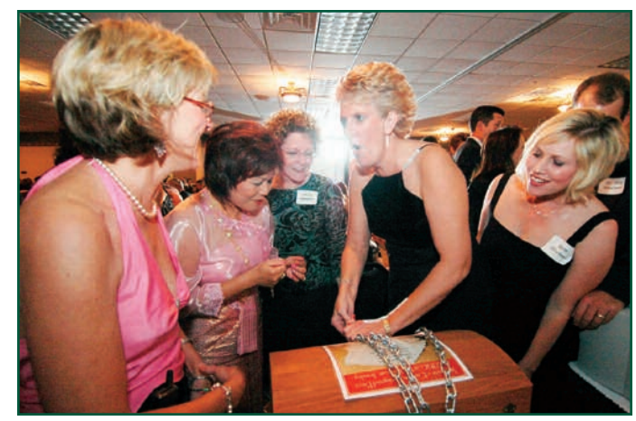
Key holders try their luck in opening the 2005 Auction treasure chest. The theme of the event was "Treasures of the World."

The theme of the 2005 Auction, Treasures of the World, carried through to decorations featuring Indian, African and Caribbean designs. Auction attendees enjoyed scrumptious appetizers featuring