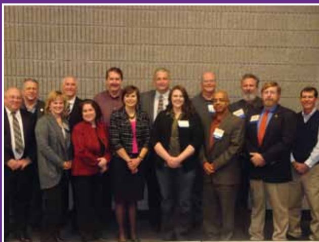
ASHCA Board of Directors at the January 2011 Workshop in Atlanta.

ASHCA’s charter members include these well-known companies and organizations: Association of Equipment Manufacturers, Agri-Services Agency, American Farm Bureau Federation, CHS Foundation, CropLife America, DiscoverRe Managers, Farm Foundation, Liberty Mutual, Pork Checkoff, National Institute for Occupational Safety and Health, Workers Compensation Fund.