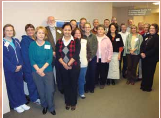
Attendees of the first AgriSafe-certified course in Wisconsin.

"Safety Guidelines for Hired Adolescent Farm Workers (SaGHAF)," based on the North American Guidelines for Children's Agricultural Tasks, are released.