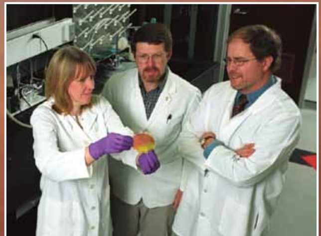
The Environmental Health Laboratory was established in 1993 and helped set the national agenda for research on disease transmission via groundwater.