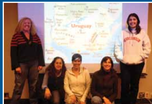
Four veterinarians from Uruguay visited this past spring, discussing life and agriculture in their country. Their trip was part of a Rotary Club exchange.