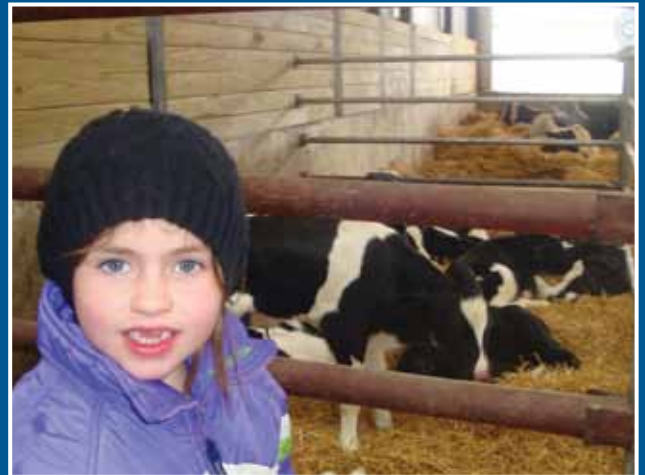
Overall, childhood non-fatal injury rates have been declining on farms and ranches.