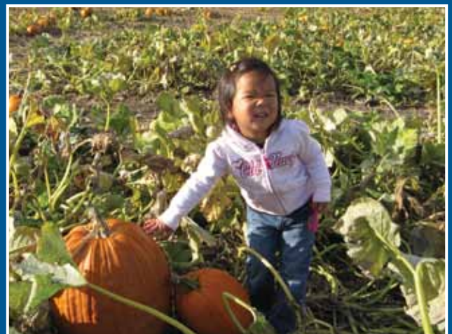
The National Children's Center updated its "Agritourism Health and Safety Guidelines for Children" http://www.marshfieldclinic.org/nccrahs/default.aspx?page=nccrahs_ag_tourism .