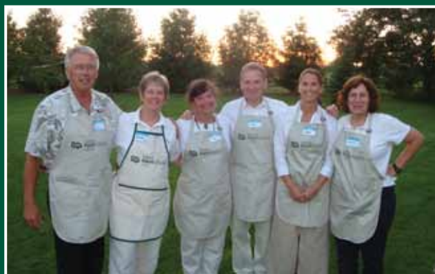
NFMF and Marshfield Clinic Research Foundation staff served at a backyard luau, one of the many great bid packages the Auction of Champions offers.