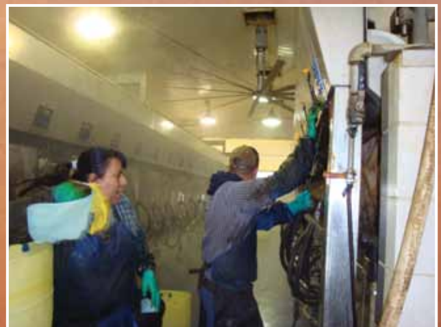
The Wisconsin Dairy Workers Safety and Health Initiative aims to address major disease and injury concerns impacting the well-being of workers.