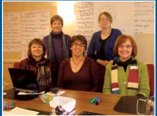
The Blueprint for Knowledge Translation team.

Since their release in 1999, the North American Guidelines for Children's Agricultural Tasks (NAGCAT) have been disseminated and studied worldwide. Organizations using the guidelines include Ohio Farm Bureau, West Virginia Extension, Wisconsin Farm Bureau, Progressive Agriculture Foundation, Successful Farming magazine, Manitoba Labour and Saskatchewan Labour.