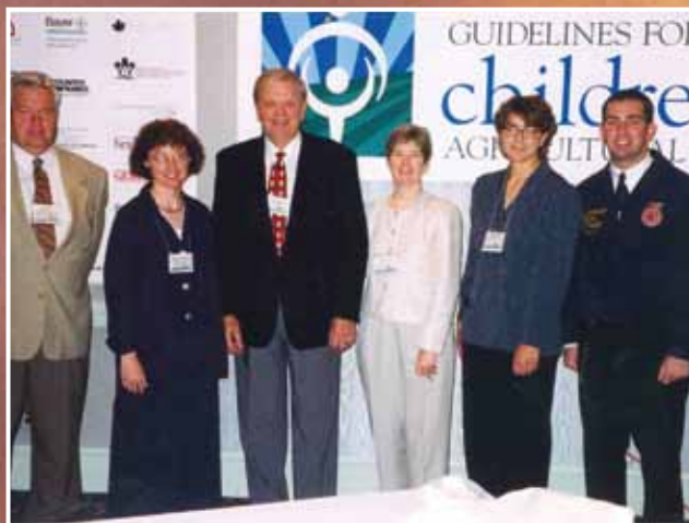
The North American Guidelines for Children's Agricultural Tasks (NAGCAT) were formally introduced at the 1999 National Institute for Farm Safety meeting.