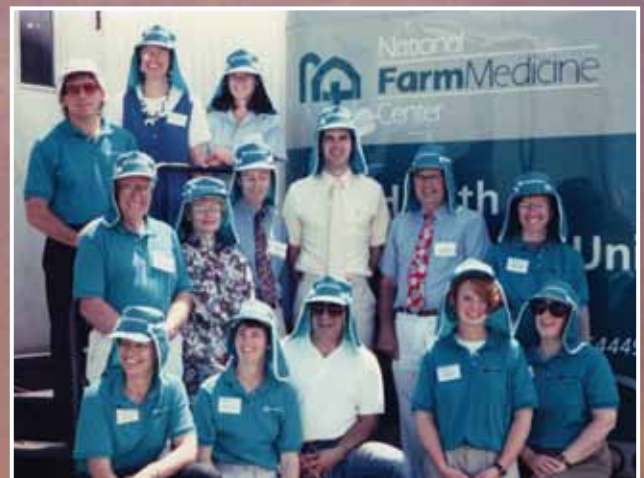
Sporting "sun safe" hats at Wisconsin Farm Progress Days, 1996.