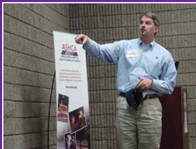
Workshop presenters from the agriculture industry shared proven, evidence-based safety and health interventions