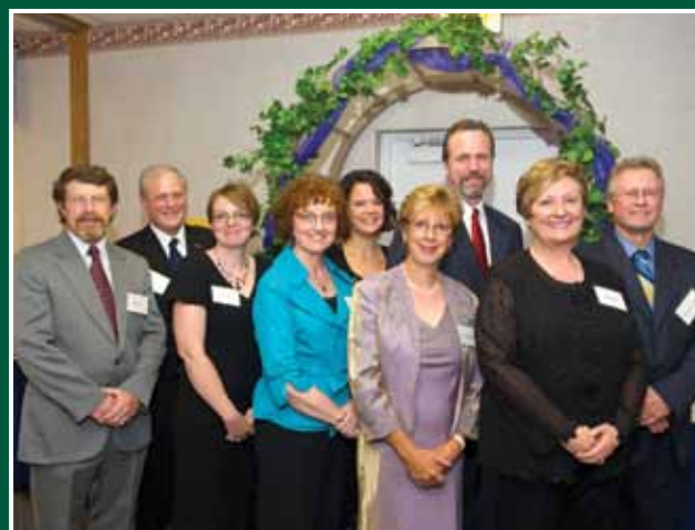
National Farm Medicine Center staff at the 2010 Auction of Champions.