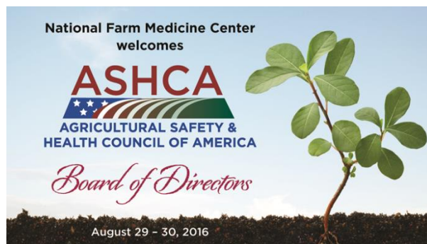
This image is being shown on Clinic monitors the week of August 29th.